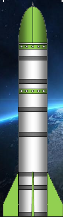
The project of a single-stage launch vehicle "ZERO"