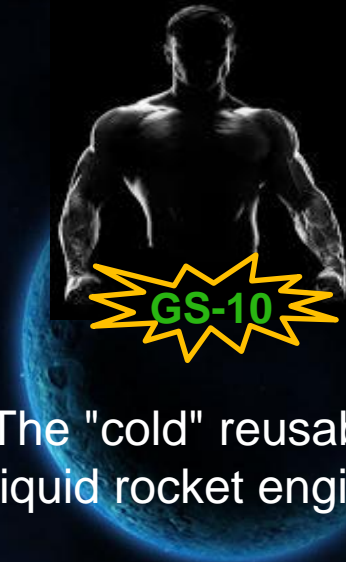
The "cold" reusable liquid rocket engine